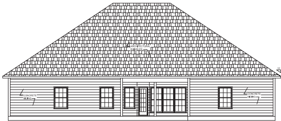
REAR ELEVATION 1/8" = 1'-0"