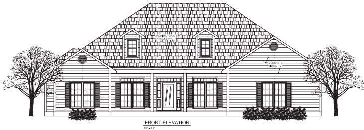
FRONT ELEVATION 1/8" = 1'-0"