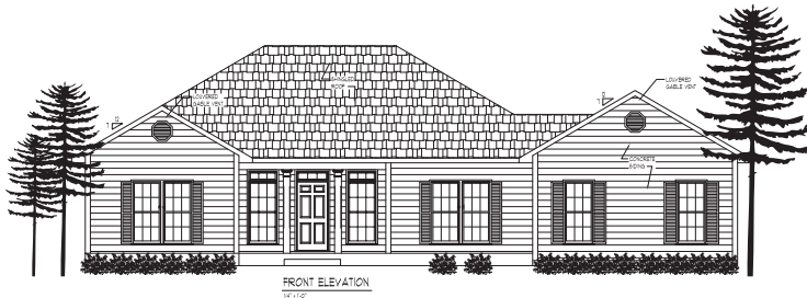
FRONT ELEVATION 14'-10"