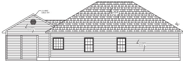
REAR ELEVATION 14'-10"